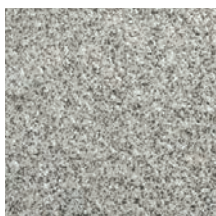
Salt & Pepper